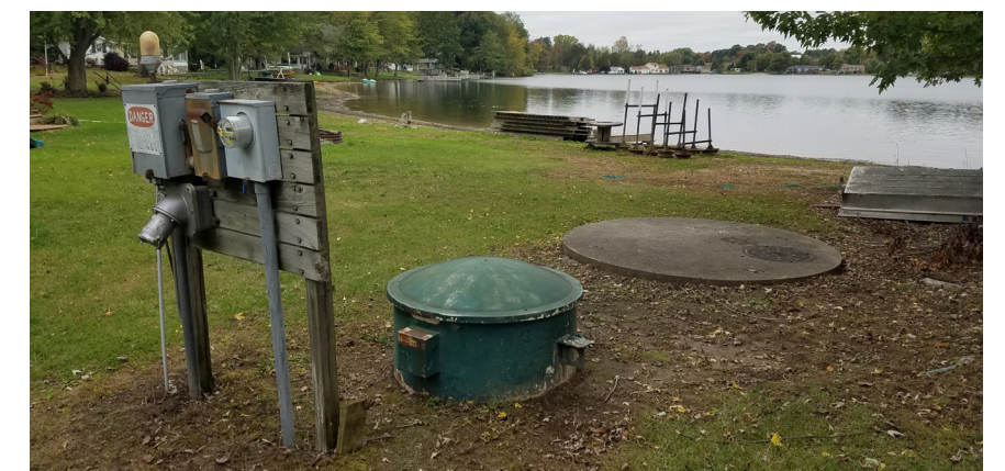
One of the WCSUA's pump stations near Crystal Lake