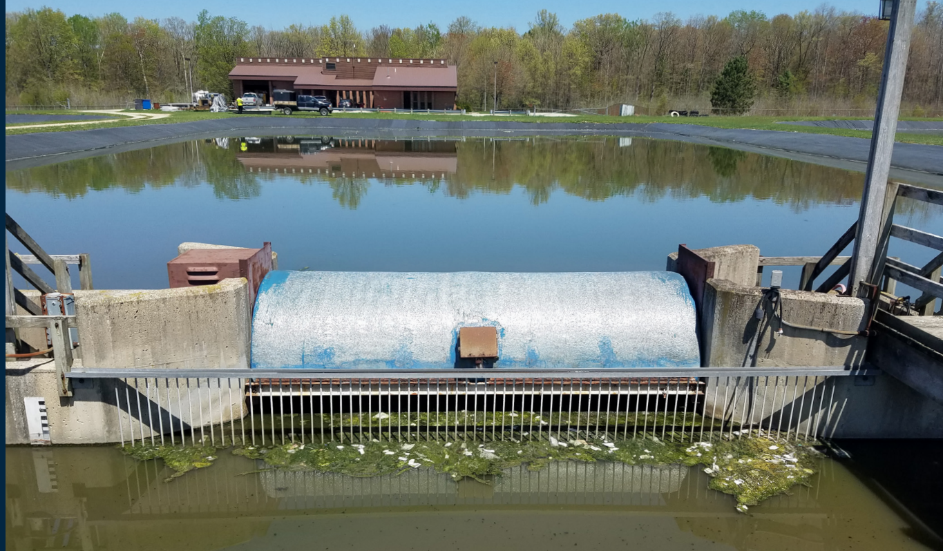
One of three WCSUA wastewater treatment plant lagoon aerators set to be replaced.