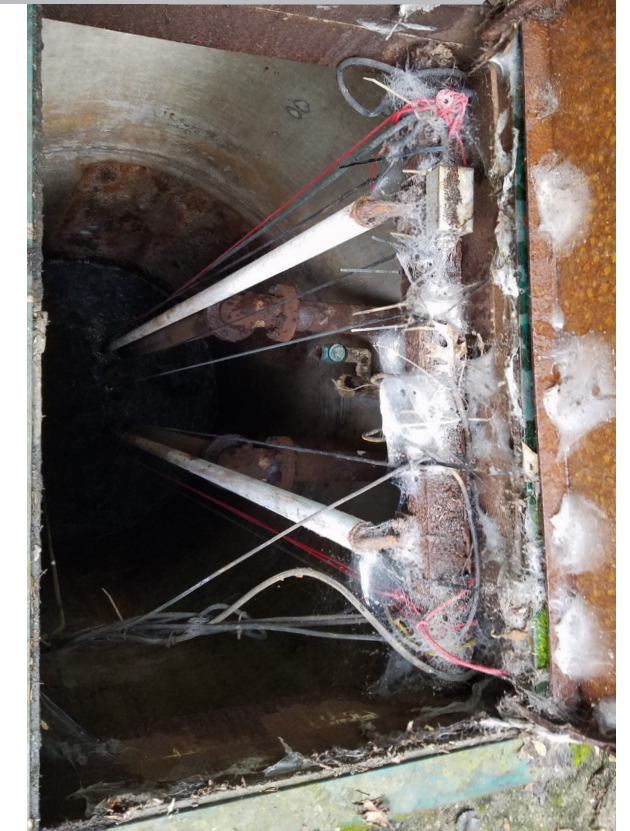
Wet well at one of WCSUA’s pump stations

station in the collection system are working beyond their expected service life. Many components have failed or are in eminent danger of failing.”