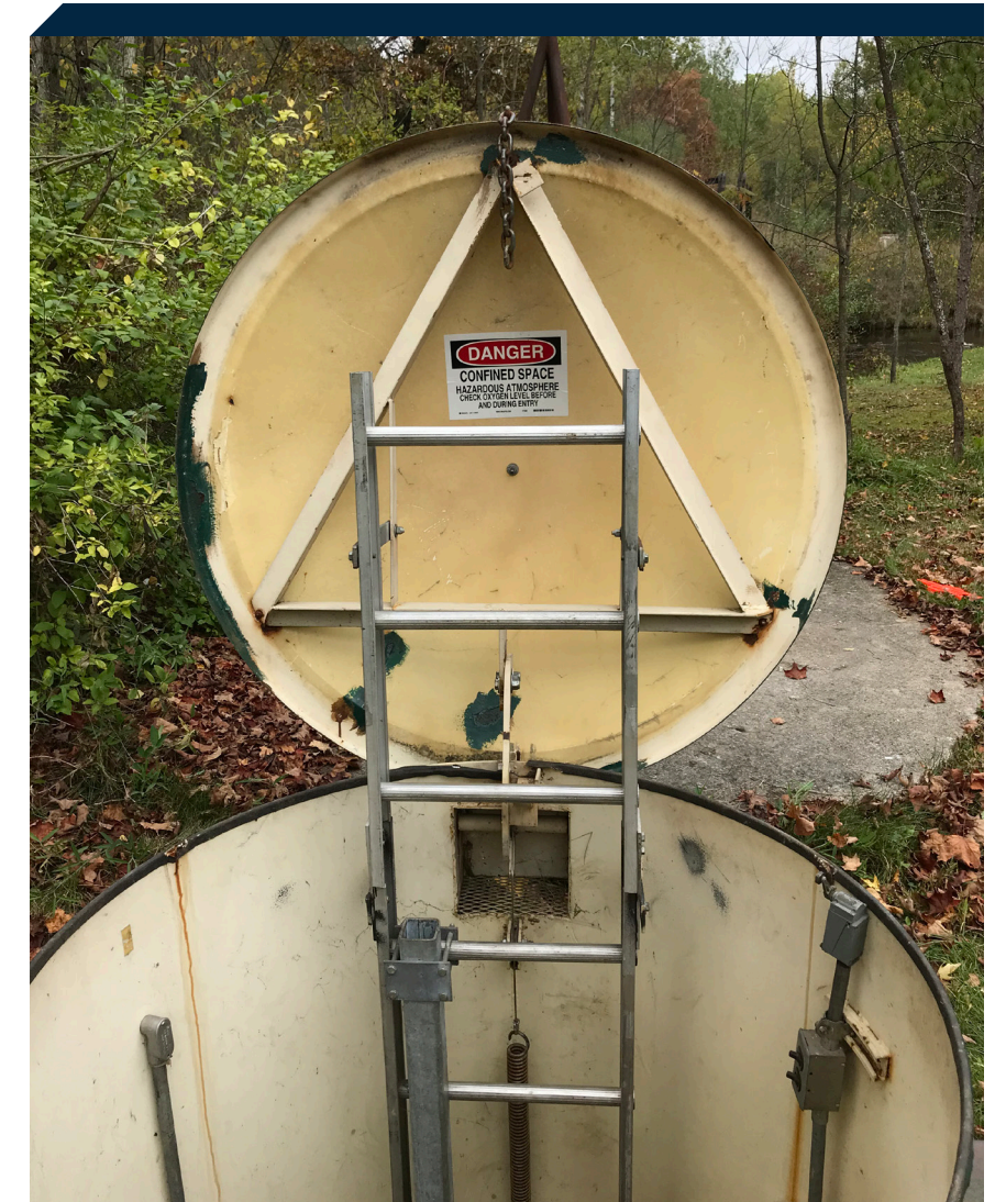
Current entrance to one of WCSUA's steel can pump stations. This project will rehabilitate all 15 of the authority's pump stations to make them more efficient.

“The sewer collection system and treatment facilities have been well maintained, but there have been no major equipment replacements or upgrades since the original construction nearly four decades ago,” House said. “All mechanical components of the treatment facility and at each pump