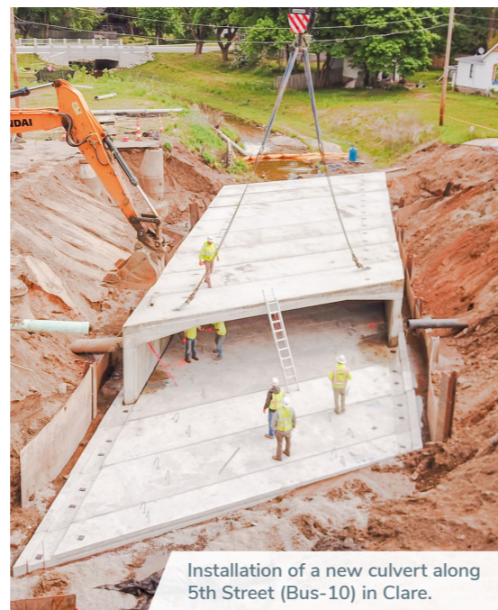
Installation of a new culvert along 5th Street (Bus-10) in Clare.