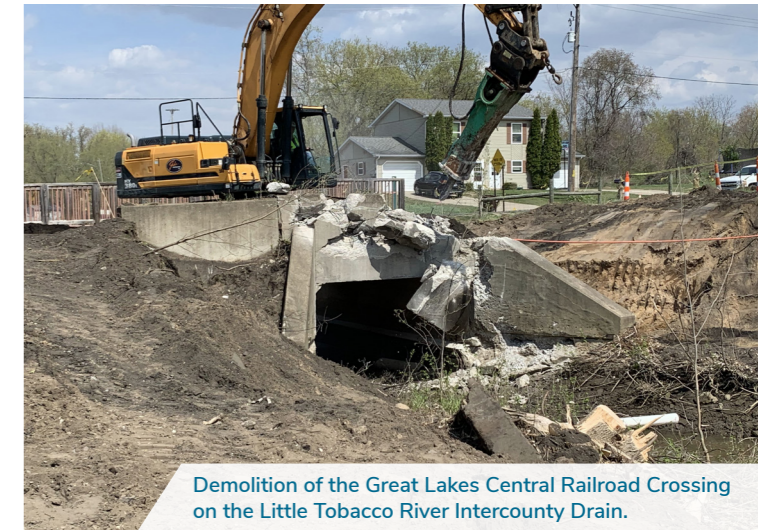
Demolition of the Great Lakes Central Railroad Crossing on the Little Tobacco River Intercounty Drain.

The bridge-replacement portion of the project included the replacement of 11 bridges that crossed the drain. These bridges were at or near life expectancy – some having been built more than 80 years ago—posing a potential risk to those that traveled them every day. These bridges were replaced with new and improved structures, creating safer, more sustainable roadways.