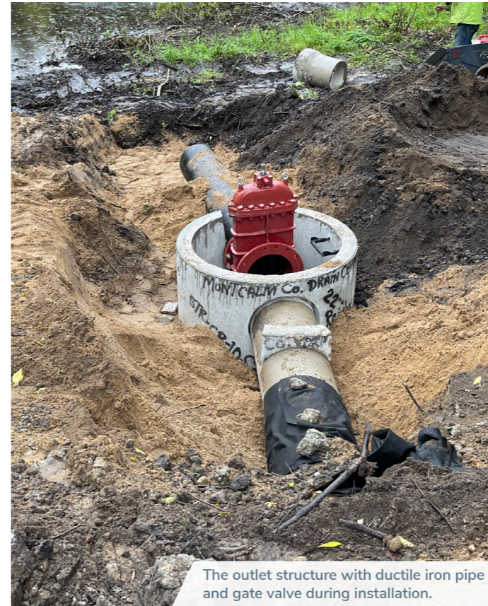
The outlet structure with ductile iron pipe and gate valve during installation.