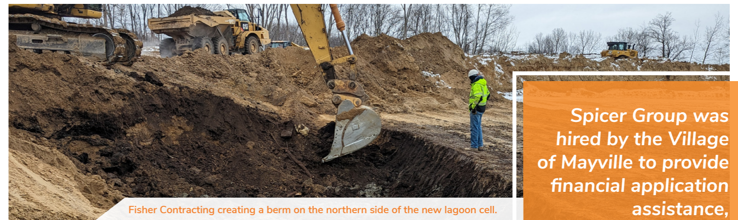
Fisher Contracting creating a berm on the northern side of the new lagoon cell.

The Michigan Department of Environment, Great Lakes, and Energy, which oversees state permitting of wastewater facilities, made recommendations to the Village of Mayville that the cells be completely drained and cleaned out to allow for the improvements to be made. In order to take a cell out of service for an extended period of time such as this, a third lagoon cell sized for 8 million gallons of working volume is