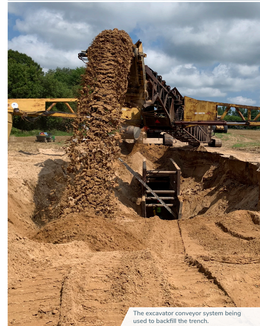
The excavator conveyor system being used to backfill the trench.