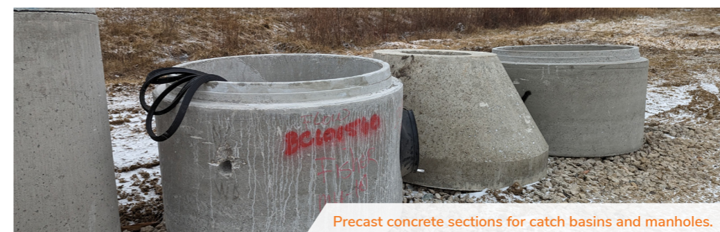
Precast concrete sections for catch basins and manholes.

Spicer Group was hired by the Village of Mayville to provide financial application assistance, engineering design, permitting assistance, and construction administration and inspection for the project.