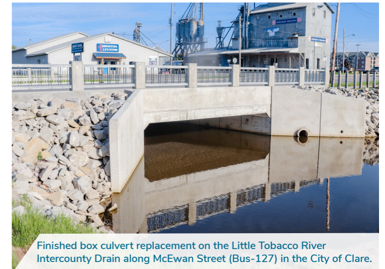
Finished box culvert replacement on the Little Tobacco River Intercounty Drain along McEwan Street (Bus-127) in the City of Clare.

In seven of the bridge replacements, three-sided precast concrete bridges with pedestal footings or pilings were used. These pedestal footings were specially designed by Spicer Group and Northern Concrete Pipe and were the first of their kind implemented on a three-sided structure. This design allowed the drain's natural stream bed to be retained, rather than be replaced with a flat-bottomed stream bed typically used in a four-sided box culvert crossing. In addition, the footings allowed for manageable loads of precast materials to be shipped to the site by lessening the need for a greater scale three-sided precast concrete bridge.